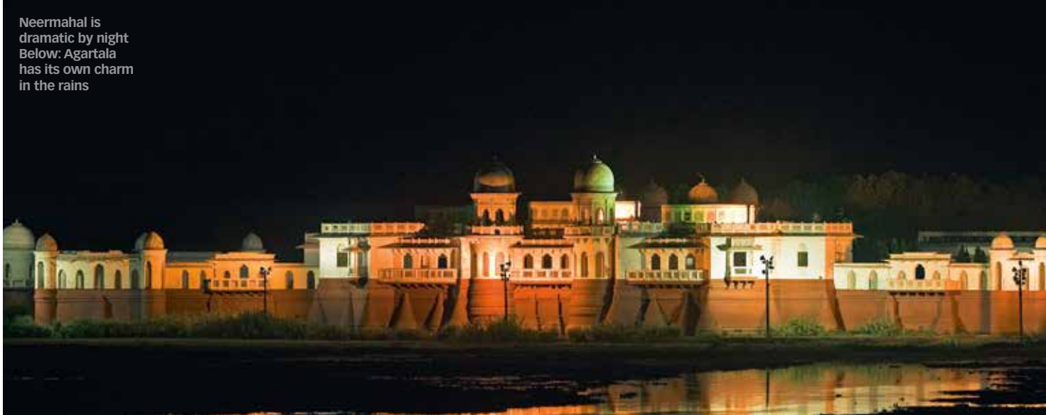
Neermahal is dramatic by night Below: Agartala has its own charm in the rains